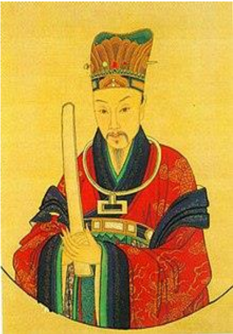
This is what they looked like in Ancient China!!