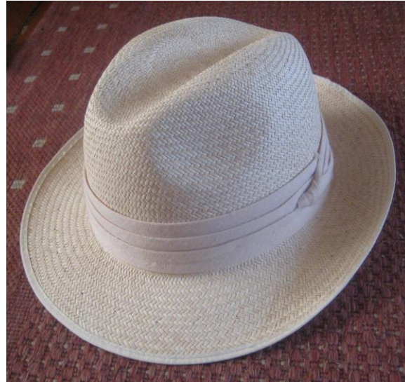
This is what they wore in Ancient China!!