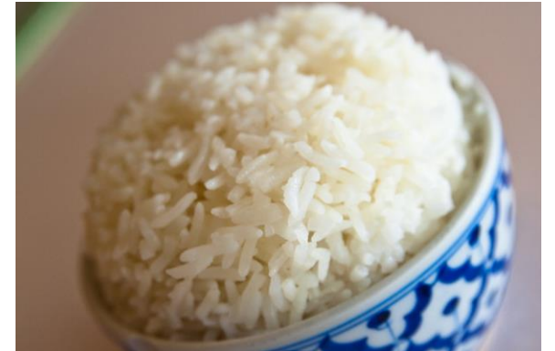
This is Rice that Ancient China would eat!!