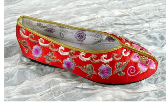
IN Ancient China they wore these shoes on their feet!!