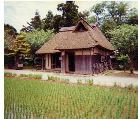
This is where the Ancient China would live !!