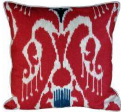
In Ancient China They Used this Pillow