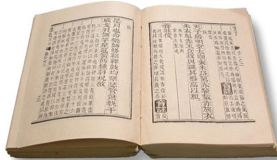
Ancient China Book