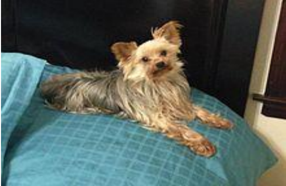
In Ancient China they have Dogs!!