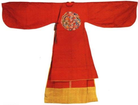
This is what they wore in Ancient China!!