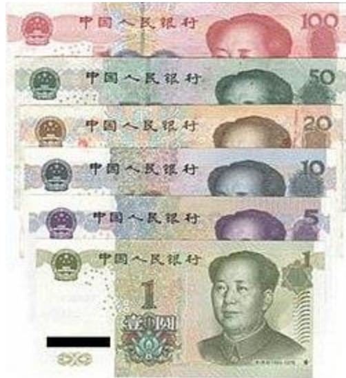
This is the Money that they used in Ancient China!!